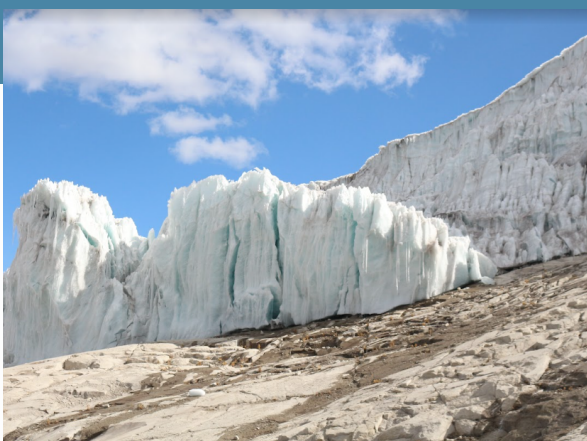
Mining concessions for the Falchani (lithium) and Macusani (uranium) projects around and on top of the Quelccaya glacier in Puno, Peru.