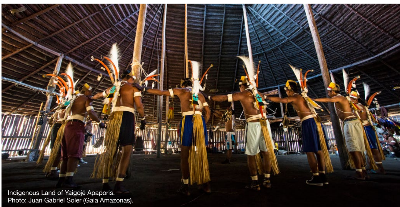
Indigenous Land of Yaigojé Apaporis.

In 19 of the 37 cases, the economic, social, and cultural rights of local communities have been violated. This is the case in the Machado gold mining project in Colombia, operated by the Canadian company Cosigo Resources LTD , which seriously impacts places sacred to the spirituality of the Yaigojé Apaporis territory Indigenous peoples, especially the La Libertad