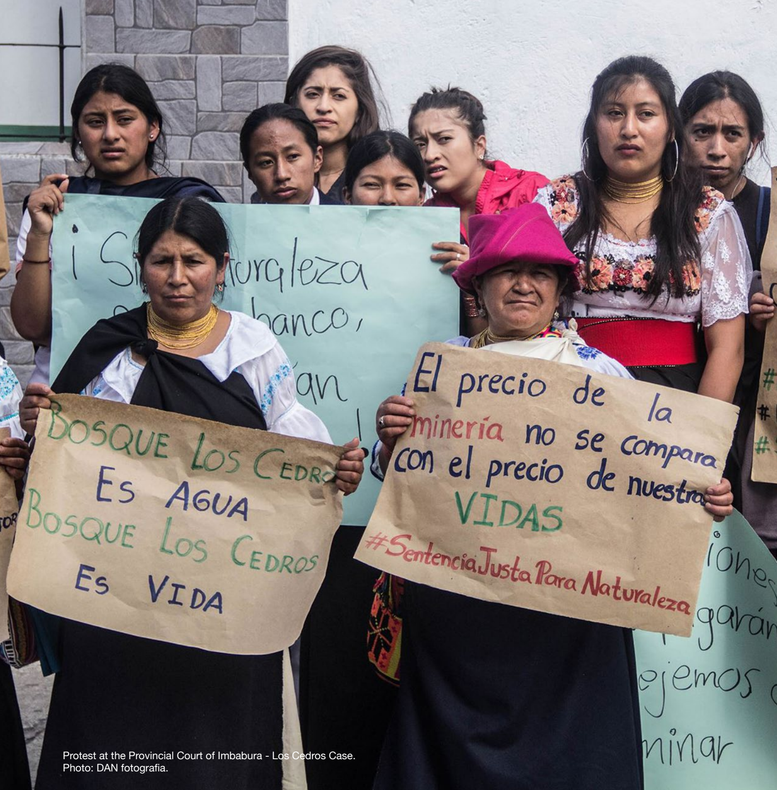
Protest at the Provincial Court of Imbabura - Los Cedros Case.