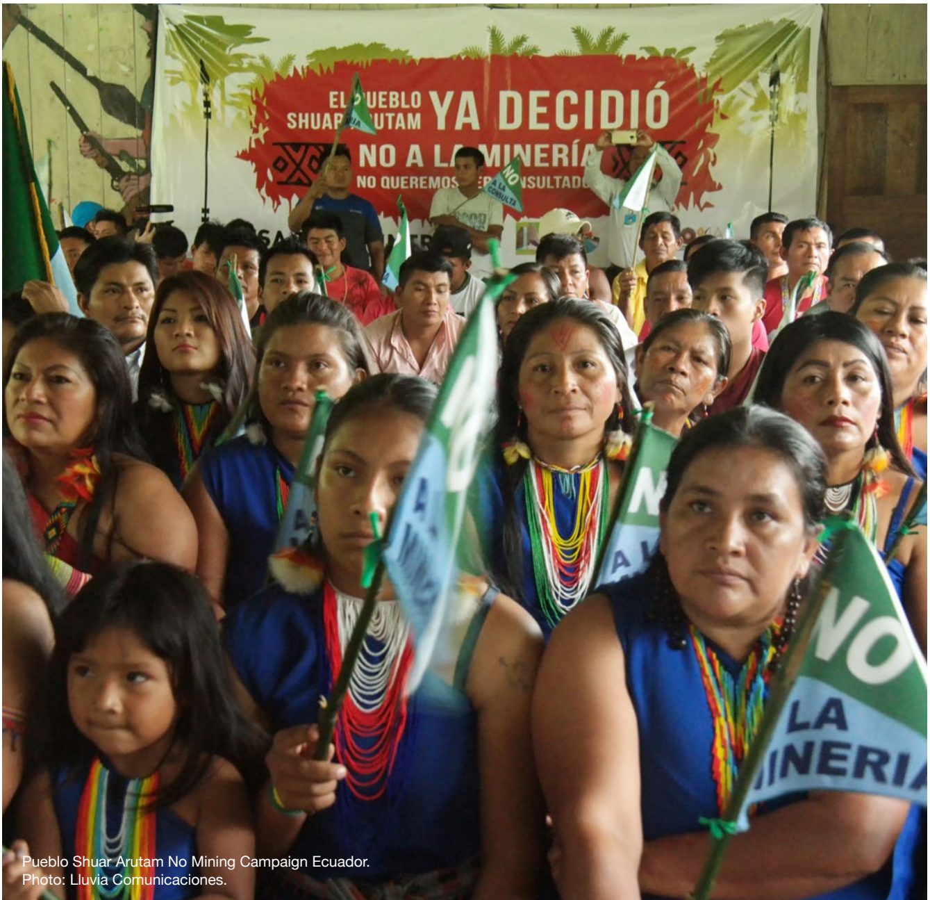
Pueblo Shuar Arutam No Mining Campaign Ecuador.

These reports demonstrate that there is a pattern of human rights and environmental abuses by Canadian corporate entities in Latin America and the Caribbean. Furthermore, the reports reveal that Canada is not implementing adequate and/or effective measures to ensure compliance with its extraterritorial obligations; moreover, none of the policies in place, in practice, prevent corporate abuses, nor do they guarantee access to justice and redress for communities impacted by the operations of Canadian companies abroad.