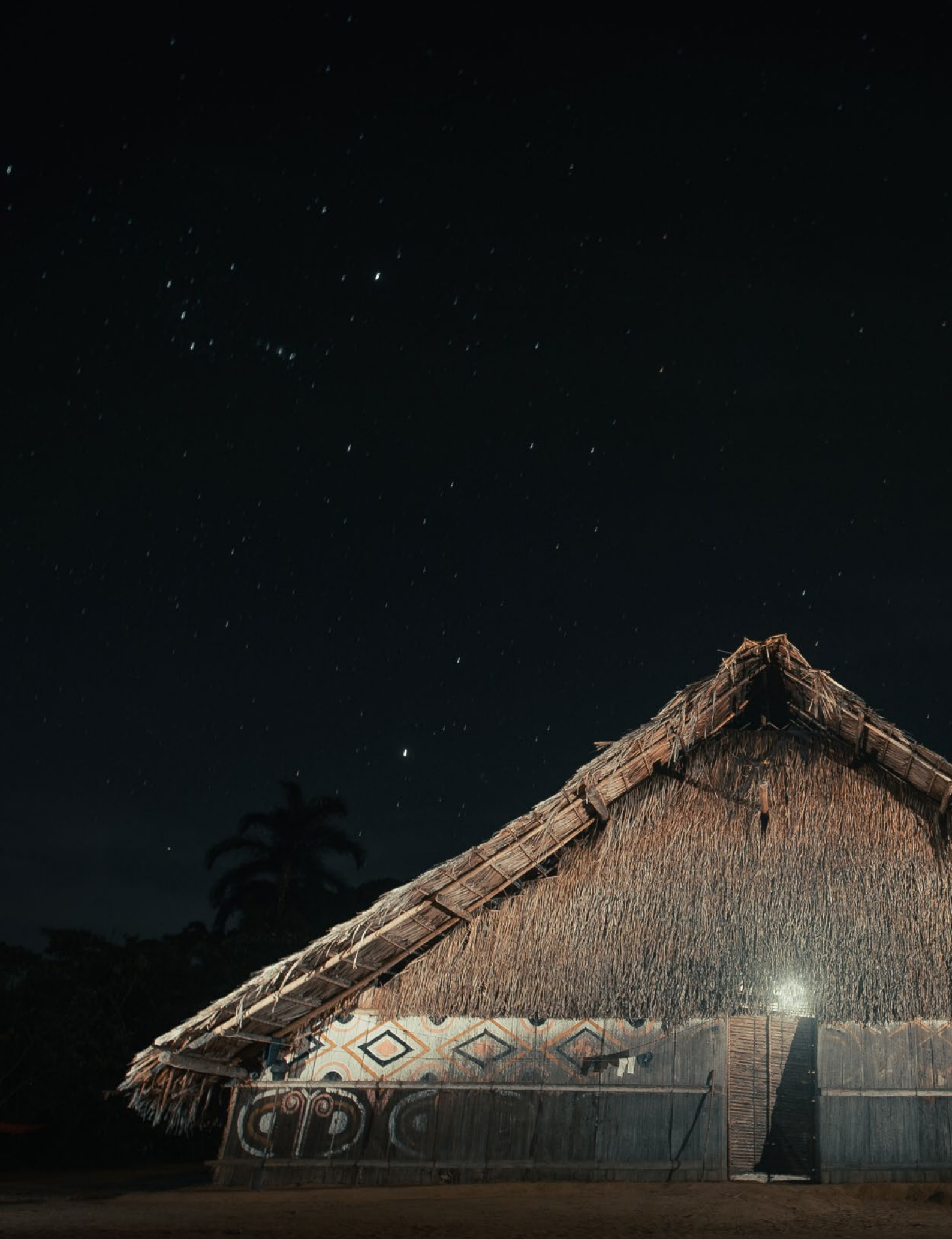
Maloca in the Pirá Paraná Indigenous Territory, Colombia.